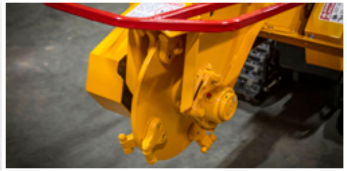
Bandit Wheel with 8 Greenteeth