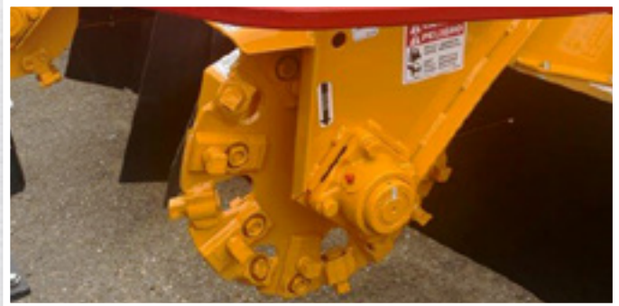
New Revolution Wheel with 24 Hex Teeth